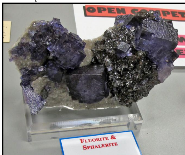
Open Competition – Outside New England

The individual specimen competition categories for 2013 are listed below the example specimen photographs from the 2011 competition: